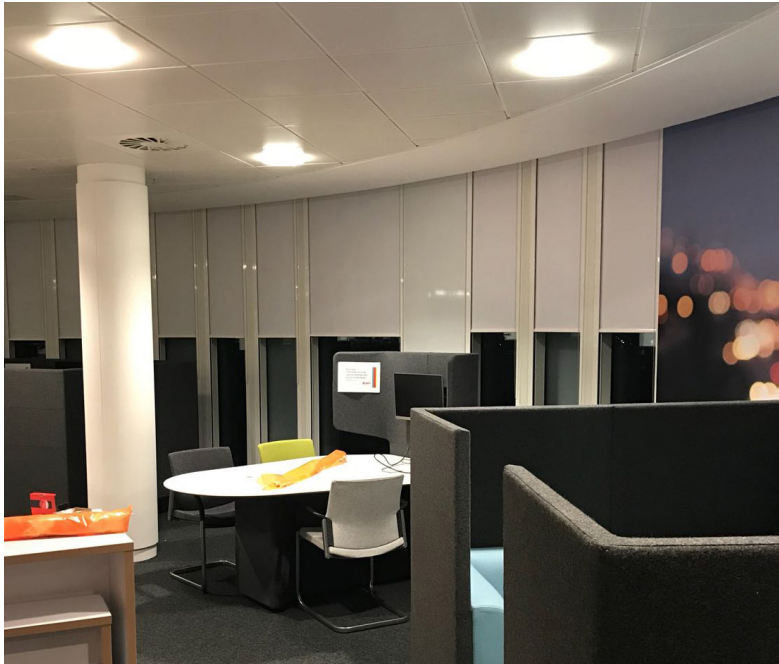
Image Blinds Solves Narrow Window Problem