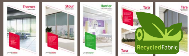
thames stour harrier tara dimout & blackout wb tara screen wb