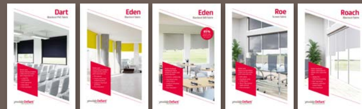
dart eden eden blackout wb roe roach