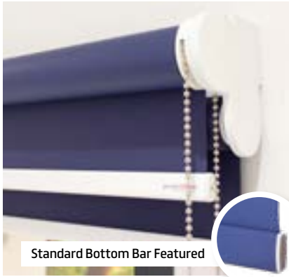
Standard Bottom Bar Featured

yewdaleDefiant® FABRIC AND BLIND SYSTEMS