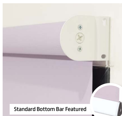
Standard Bottom Bar Featured

yewdaleDefiant® FABRIC AND BLIND SYSTEMS