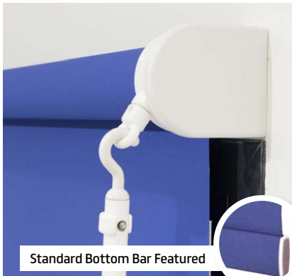
Standard Bottom Bar Featured

yewdaleDefiant® FABRIC AND BLIND SYSTEMS