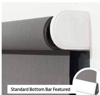
Standard Bottom Bar Featured

yewdaleDefiant® FABRIC AND BLIND SYSTEMS