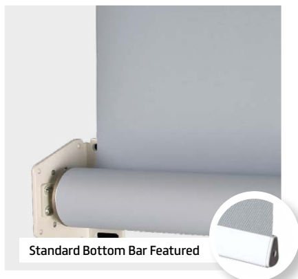
Standard Bottom Bar Featured

yewdaleDefiant® FABRIC AND BLIND SYSTEMS