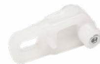
6201W roller runner